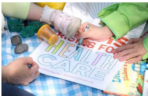
Children and moms using their crayons and creativity for health care.

MomsRising led a campaign that resulted in a monumental victory when the U.S. Department of Health and Human Services reinforced that states must provide 12 months of continuous coverage for children under Medicaid and CHIP (Children's Health Insurance Program), ensuring uninterrupted care for millions.