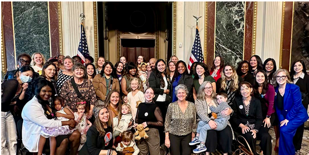
MomsRising brought moms from 20 states to share their child care stories with top leaders at the White House. Our volunteers were thrilled when subsequently, the White House asked Congress for the $16 billion in child care stabilization funds we requested!